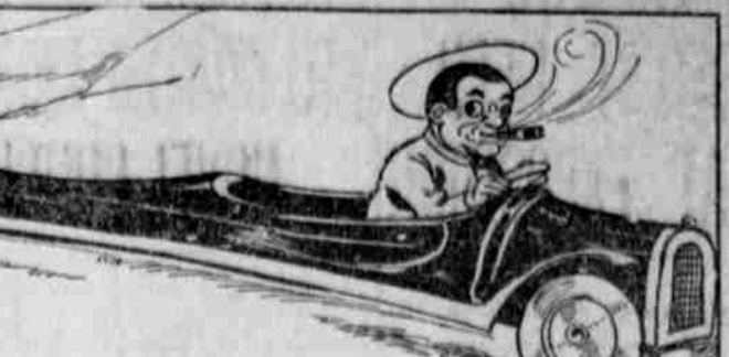
No. 5—The armored car crumpled! My own vehicle returned to its normal size and I drove off, having defeated the enemy without spilling blood!