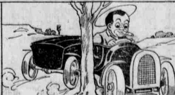
No. 2—I maneuvered around a while, devising the best way to deal with the enemy!