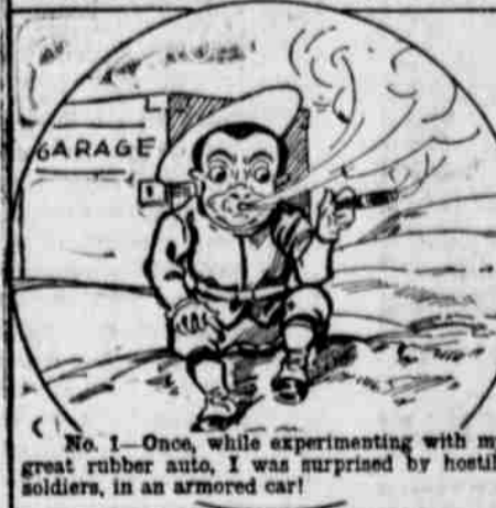
No. 1—Once, while experimenting with my great rubber auto, I was surprised by hostile soldiers, in an armored car!

BRAINS WIN IN BATTLE AGAINST STEEL RUBBER AUTO IN MASTER HANDS!