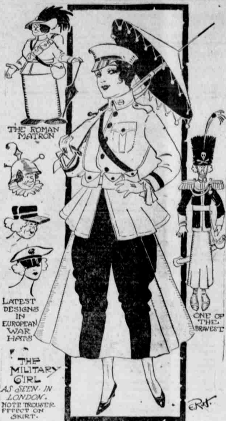
THE ROMAN MATRON