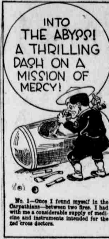
No. 1—Once I found myself in the Carpathians—between two fires. I had with me a considerable supply of medicine and instruments intended for the red cross doctors.