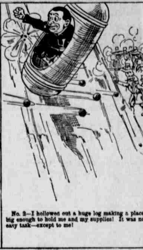
No. 2—I hollowed out a huge log making a place big enough to hold me and my supplies! It was no easy task—except to me!