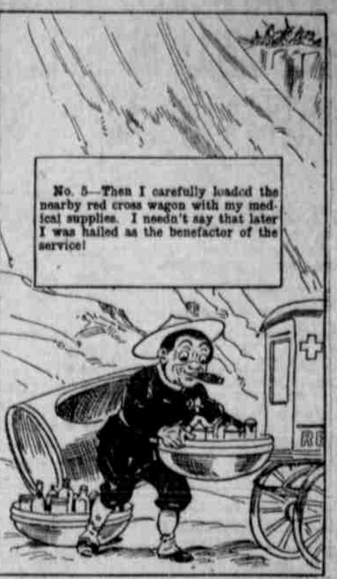
No. 5—Then I carefully loaded the nearby red cross wagon with my medical supplies. I needn't say that later I was hailed as the benefactor of the service!

place became for the time a true sanctuary, a place where God meets with his people. Although nothing of special attraction had been previously announced more than Christian worship and religious exercises still the meeting was well attended and the lively interest shown gives evidence to this fact that church life and interest in the gospel message are not dead in Central Point and the inclination of the people to respond to the call of gospel work gives promise of a good harvest in the future.