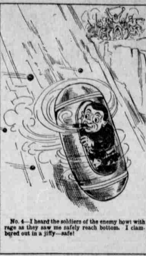
No. 4—I heard the soldiers of the enemy howl with rage as they saw me safely reach bottom. I clambered out in a jiffy—safe!