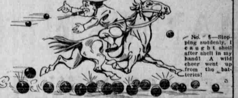
No. 5—Stopping suddenly, I caught shell in my hand! A wild cheer went up from the batteries!