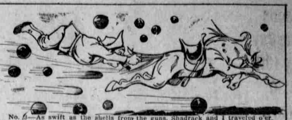
No. 6—As swift as the shells from the guns, Shadrack and I traveled over the plain! His sides sleek with sweat!