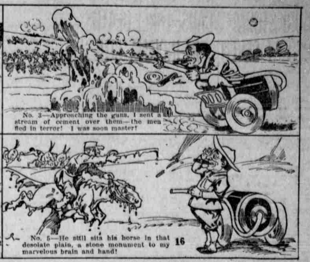
No. 3—Approaching the guns I sent a stream of cement over them—the men fled in terror! I was soon master!