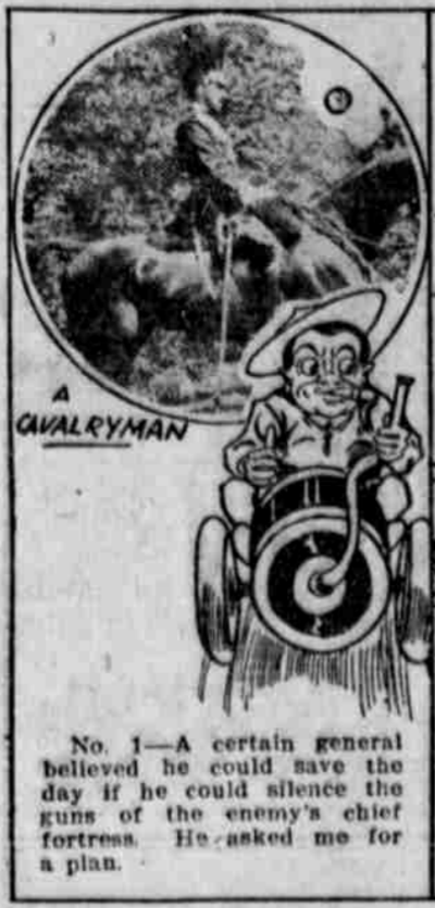
No. 1—A certain general believed he could save the day if he could silence the guns of the enemy's chief fortress. He asked me for a plan.