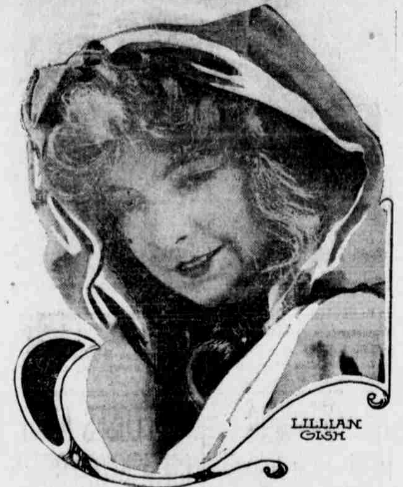
Miss Lillian Gish posing especially to illustrate this beauty article.

Laces Draped About Faces Make Them Prettier—Lillian Gish Gives a Beauty Talk Today