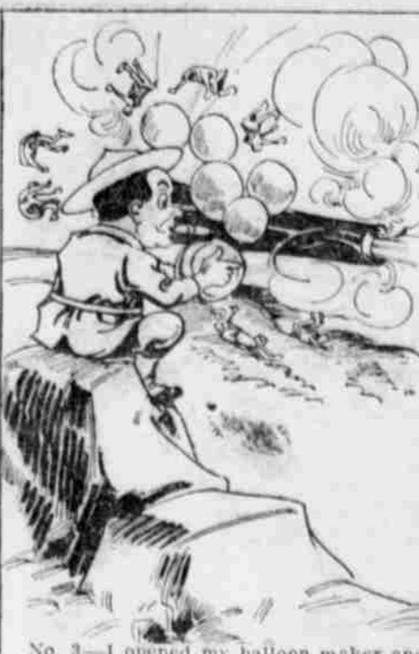
No. 3—I opened my balloon maker and quickly created a hundred or so multi-colored bags! Then I fastened them all together on a wire!