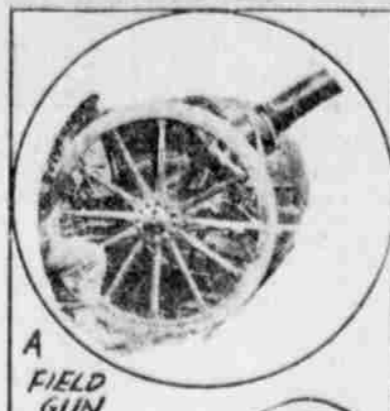
A FIELD GUN

No. 1—I just perfected my gas balloon maker—part of my wonderful Maggrip! Recently, in Portland, I stood watching the Russians shoot a big gun!