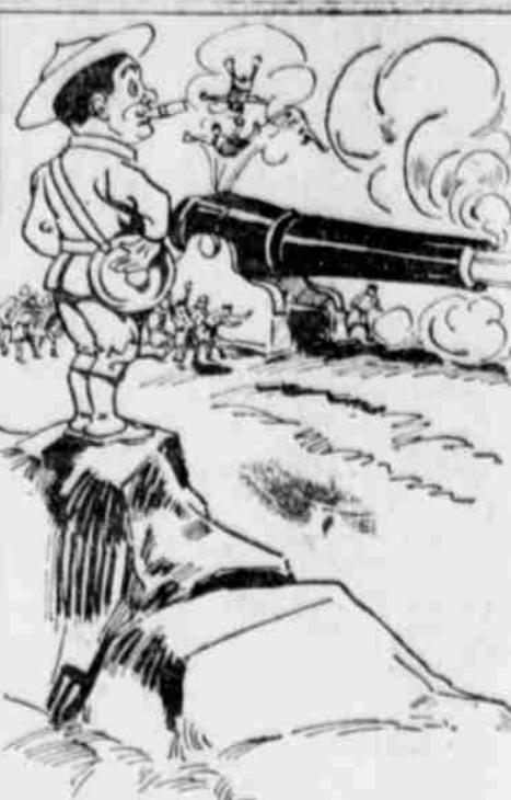
No. 2—At each explosion, a dozen of the gun crew were thrown off their feet! An idea came to me!

No. 1—I just perfected my gas balloon maker—part of my wonderful Maggrip! Recently, in Portland, I stood watching the Russians shoot a big gun!