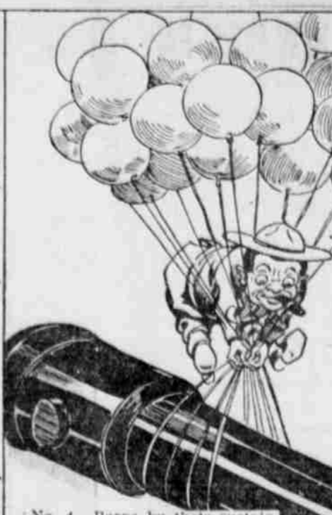
No. 4—Borne by their sustaining power I hovered over the big gun, then fastened the wire under it. We drifted away.