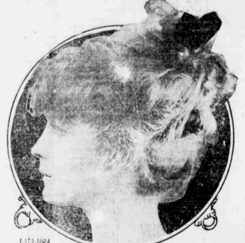
Miss Lillian Gish posing especially to illustrate this beauty article.

'Thought and Care Bestowed Upon One's Hair Adds to One's Beauty'—Dorothy Gish.