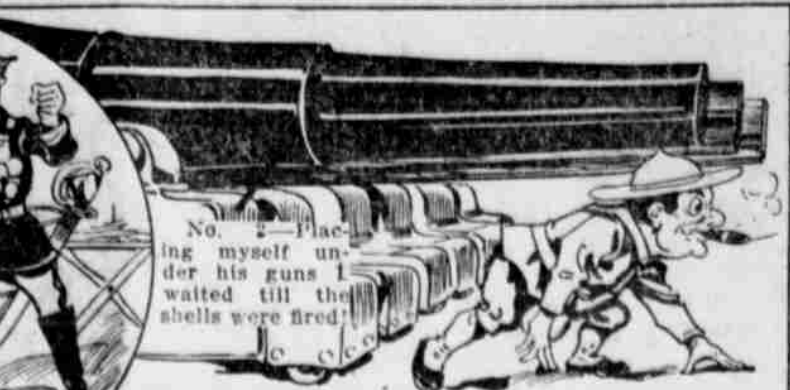
No. 2—Placing myself under his guns I waited till the shells were fired.