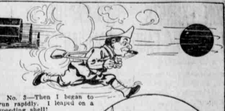
No. 3—Then I began to run rapidly. I leaped on a speeding shell!