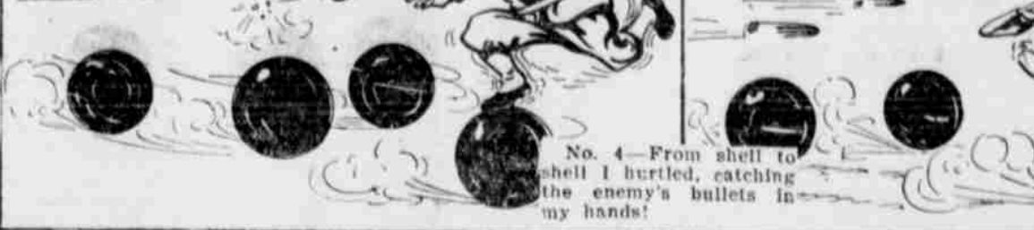
No. 4—From shell to shell I hurried, catching the enemy's bullets in my hands!