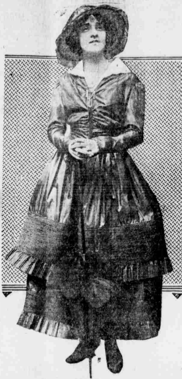
The "Slim Princess"—Miss Elsie Janis is just as slim as she used to be, even though her little grace is somewhat obscured in the billowy folds of the 1930 styles which she recently adopted.