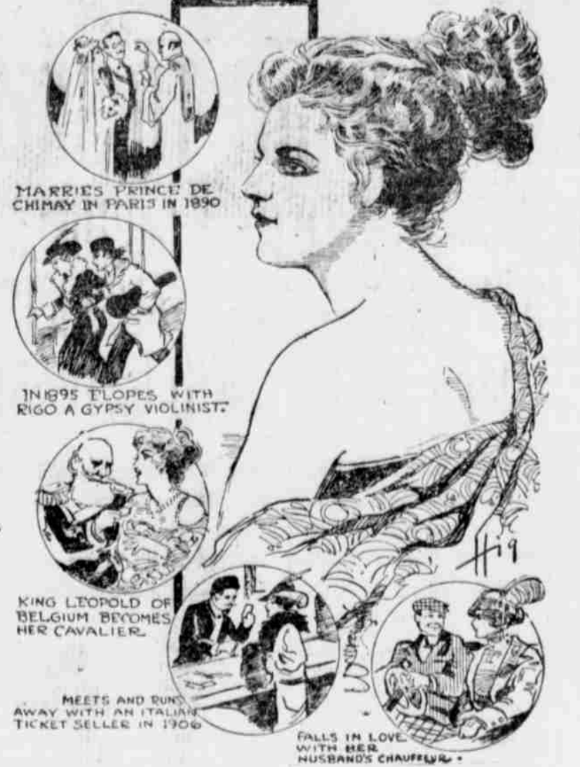
Once famous American Beauty disinherited. Clara Ward, who was the Princess de Chimay, and sketches showing her various love episodes which scandalized the world.

It's poor economy to use a "make-shift" when you can buy the best ladder on the coast, made at home, at a lower price than any other good ladder. This ladder is securely braced throughout, a rod under each step, no nails to come out, nothing but rivets and bolts used in its construction. Orders by phone or mail filled promptly. For sale by all dealers and factory, 36 S. Riverside, phone 392-J.