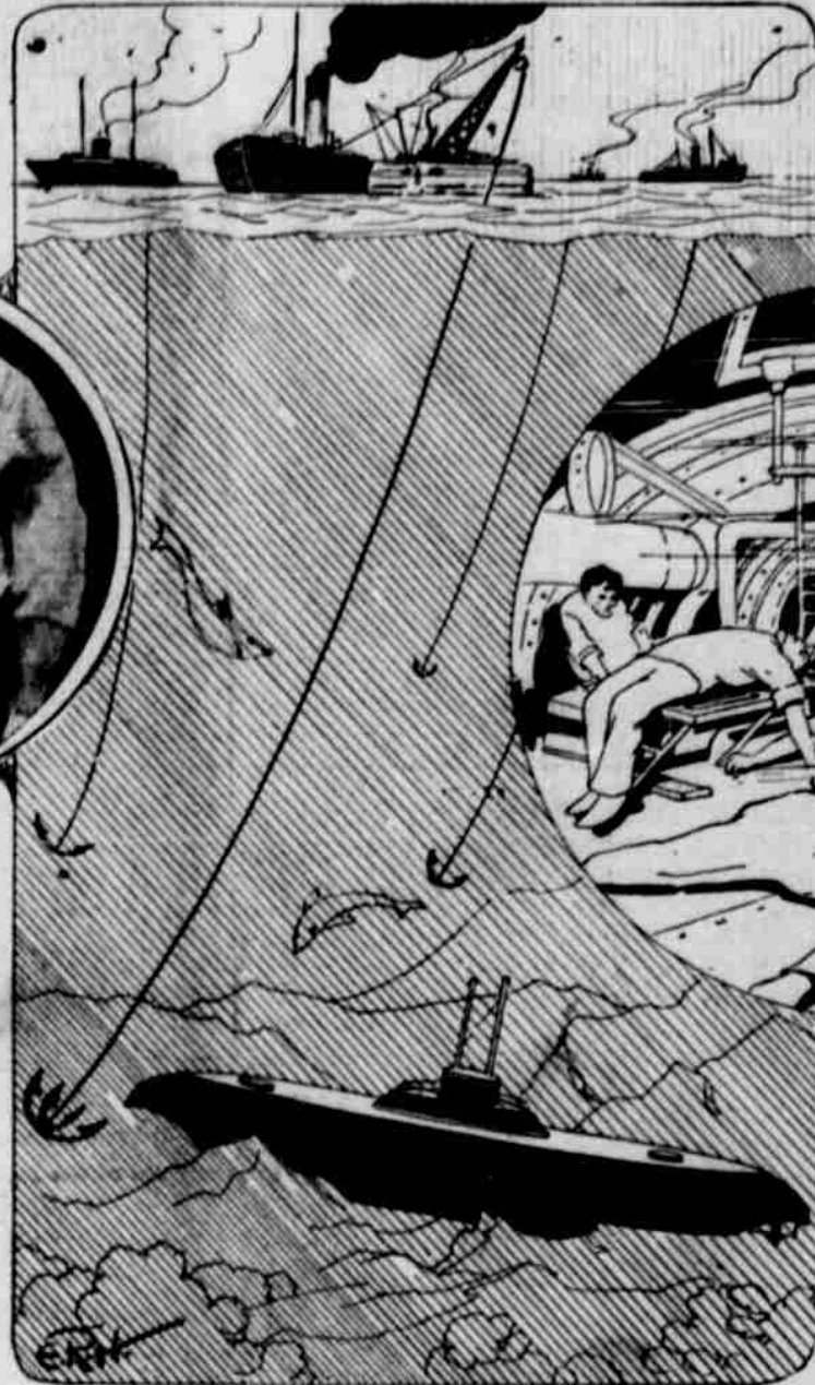
Grappling for Sunken Submarine, to be Raised by Derricks on Rescue Vessel.