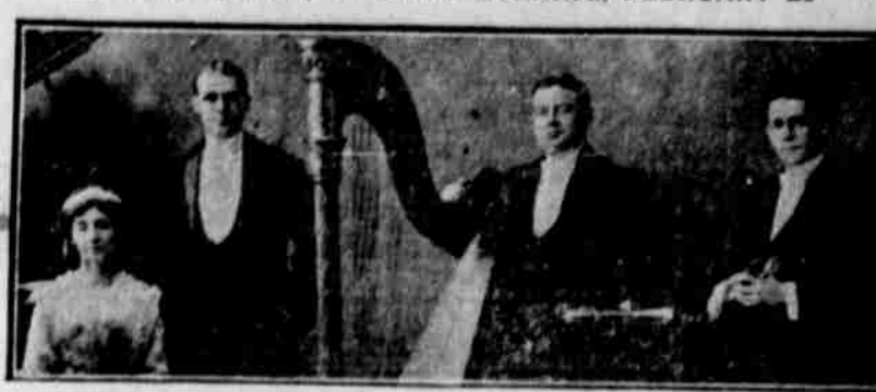
THE HARMONY CONCERT PARTY.

AT NATATORIUM, TUESDAY EVENING, FEBRUARY 23