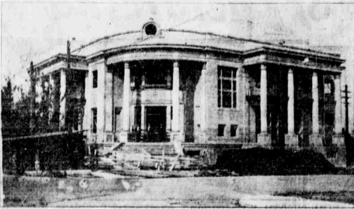
ELKS' NEW TEMPLE, NOW NEARLY COMPLETE, COSTING $60,000 COMPLETE