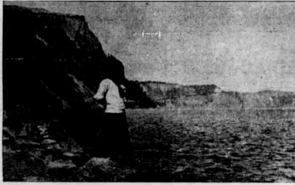
Fishing at Crater Lake—The Lake is Full of Trout Weighing as High as Six Pounds.

There are extensive opportunities in Jackson county for hunting and fishing. The Rogue river especially, offers royal sport at certain seasons in fly fishing for the steelhead (rainbow) trout, the fish varying from three to twelve pounds or more in weight. Larger salmon may be caught by trolling or by spoon, and there are a great many streams in the foothills and mountains where brook trout are plentiful in season. The several lakes of the district, including Fish Lake, Squaw Lake, Four-Mile Lake and Lake of the Woods—the latter two lakes being just outside the county boundaries to the east—offer splendid outing sites, including fishing, hunting and boating. Quail and grouse are plentiful in many sections of Jackson county, and deer are fairly numerous in nearly every wooded part of the county at certain times, and plentiful at nearly all times in other sections. Bear and cougars are not so plentiful, but may often be found in the most isolated districts.