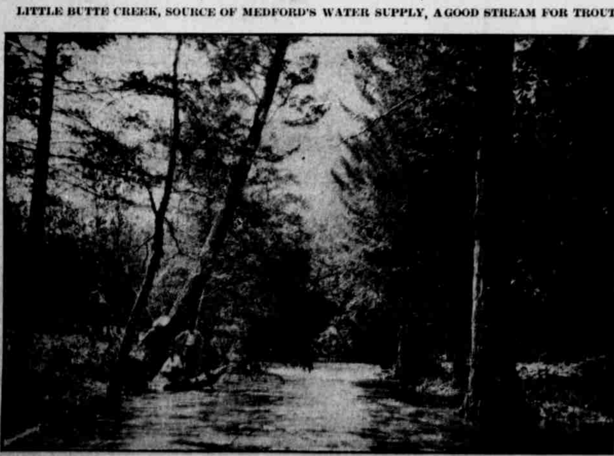
LITTLE BUTTE CREEK, SOURCE OF MEDFORD'S WATER SUPPLY, A GOOD STREAM FOR TROUT.