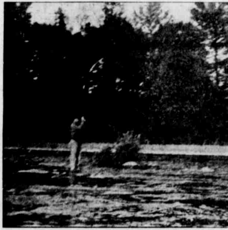
Even a Two-Pound Steelhead Makes a Game Fight.

During the last six years every incorporated town in the county, with one exception, has erected an up-to-date school building, and many of the rural districts have school facilities not to be excelled