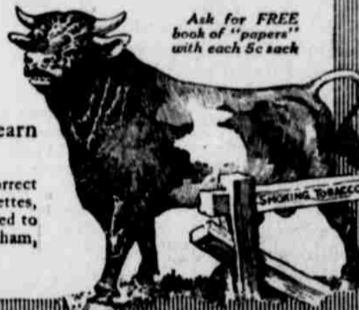
Ask for FREE book of "papers" with each 5c sack