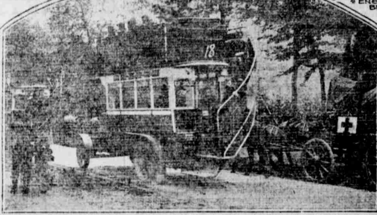
THE FAMILIAR LONDON MOTOR BUS WHICH FIGURED PROMINENTLY IN THE RETREAT FROM ANTWERP.

AMSTERDAM, via London, Oct. 28.—Midnight—A dispatch to the Telegram from Stubs says: "The guns which were silent yesterday were again firing today. The British ships have renewed the bombardment of the German trenches at Ostend.