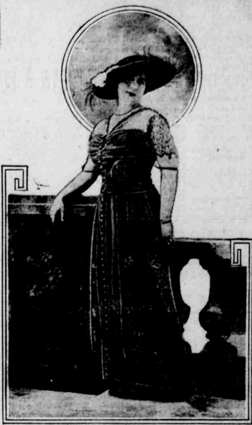
One of the new fitted dresses buttoning down the front, of black taffeta, it has a tunic of jetted muscadine de sole and a corsage top of old gold in a.