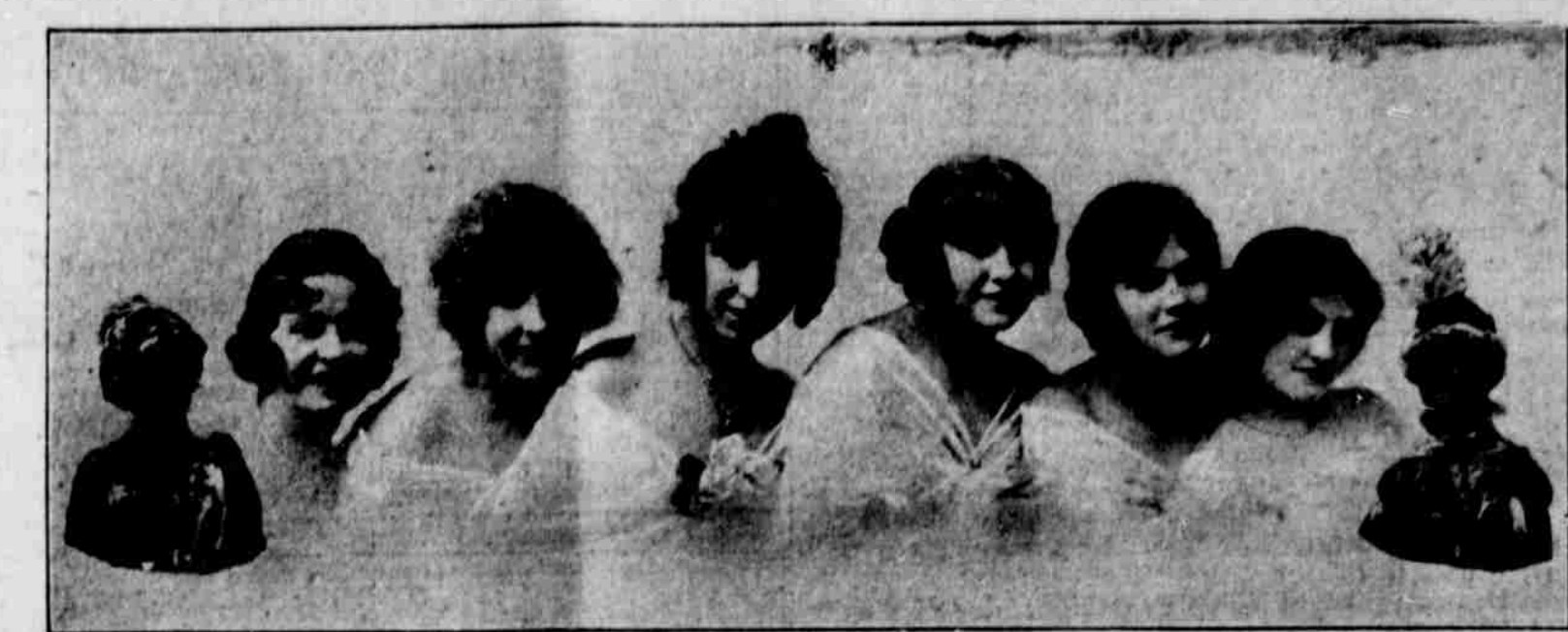
Bunch of Beauties in the Candy Shop at the Page Theater Tonight