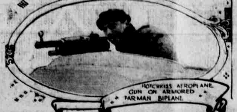
HOTCHKISS AEROPLANE GUN ON ARMORED FARMAN BIPLANE

For the first time in the history of aviation the general practical value of air craft in time of war is expected to be shown in the hostilities between Austria and Serbia. Austria, with her six dirigibles, supplementing more than one hundred and fifty aeroplanes, has an advantage over her opponent, according to theorists, equal to many thousand seasoned soldiers. Her pilots are among the best in the world, known for their fearlessness and trained to intelligent co-operation with the land forces. Serbia is practically unknown in aeroplane records. The little Power has twenty machines as part of her military equipment, but the pilots lack the training of the Austrian aviators. Much of the Austrian aviation equipment is said to be patterned after that used by France and Germany. The Hotchkiss rapid fire gun is installed on many of the machines.