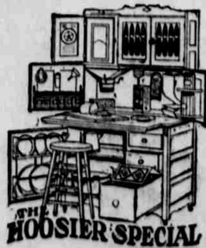
THE HOOSIER SPECIAL

Sanitary, self-cleaning metal flour bin, 50 pounds capacity. Pantry shelf that holds 40 or more cereals and packages. Roomy cupboard that holds 70 or more dishes. Sanitary rolling pin rack. Handy utensil hooks. Clock-faced, patented want list (upper middle door). Flavoring extract shelf (upper right door). Crystal glass tea and coffee jars with airtight screw lids (lower left door). Crystal glass salt jar (lower left door). Metal sugar scoop (in sugar bin).