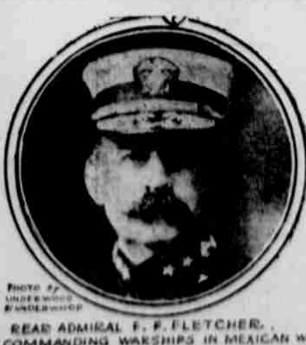
REAR ADMIRAL F. F. FLETCHER, COMMANDING WARSHIPS IN MEXICAN WATERS