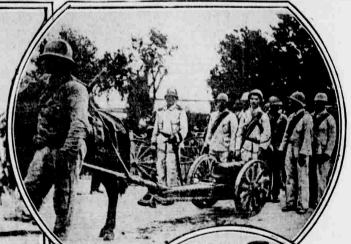
FEDERAL ARTILLERY IN TORREON PHOTOGRAPHED DURING VILLA'S ATTACK