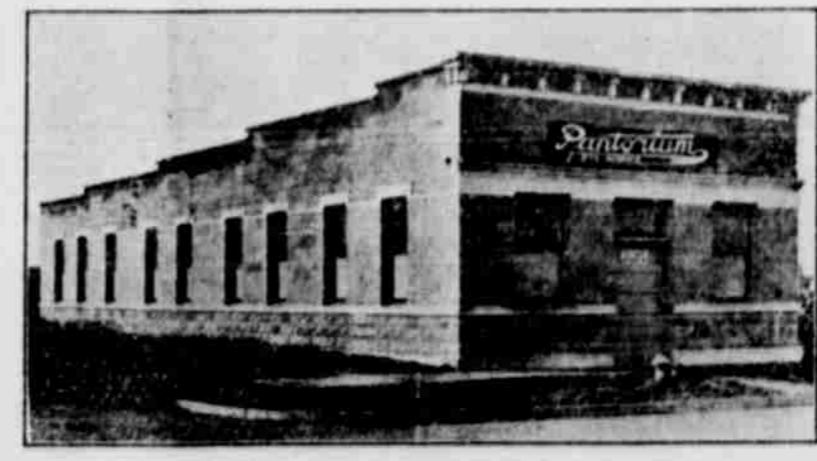
Our New, Modern Plant

At a great cost we have installed one of the best dry cleaning plants in the country, and there isn't its equal in this city. The best and most modern equipment plus the service of real experts insure you the BEST WORK when you patronize us.