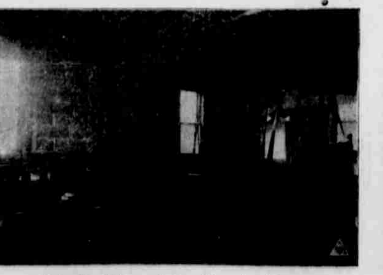
Interior View of Dry Cleaning Room

If you pay more than our prices you are simply paying for lack of proper equipment and facilities that necessitate waste and higher prices to you.