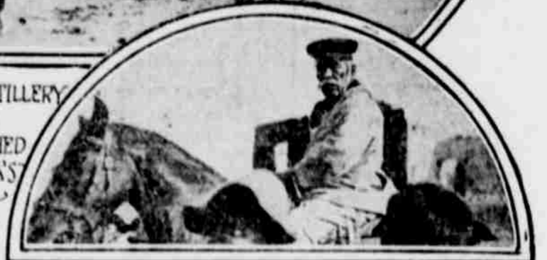
GENERAL OCARRANZA, VELASCO'S ARTILLERY AIDE, REPORTED WOUNDED. PHOTOGRAPHED AT TORREON