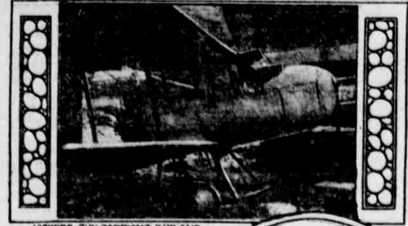
VICKERS GUN CARRYING BIPLANE

At the Fifth International Aero Exhibition in London among the most interesting exhibits were the new biplanes built for military use under the new requirements of the British army. Among these is the gun carrying Vickers machine driven by a 100-horse power Gnome motor of the new monovalve type.