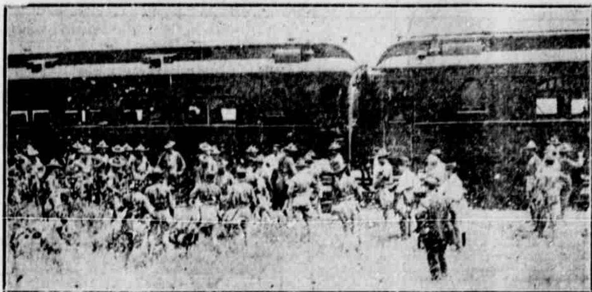
Within a short time after President Wilson decided that the Texas border needed more troops to protect citizens there against Mexican marauders the Ninth Infantry, which was at Fort Thomas was on its way to the front.