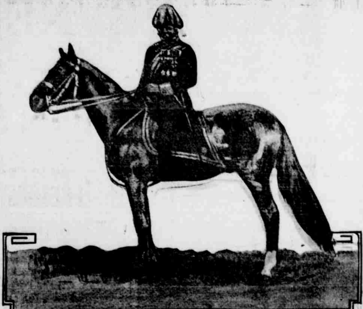
SIR JOHN FRENCH ON GOVAIR