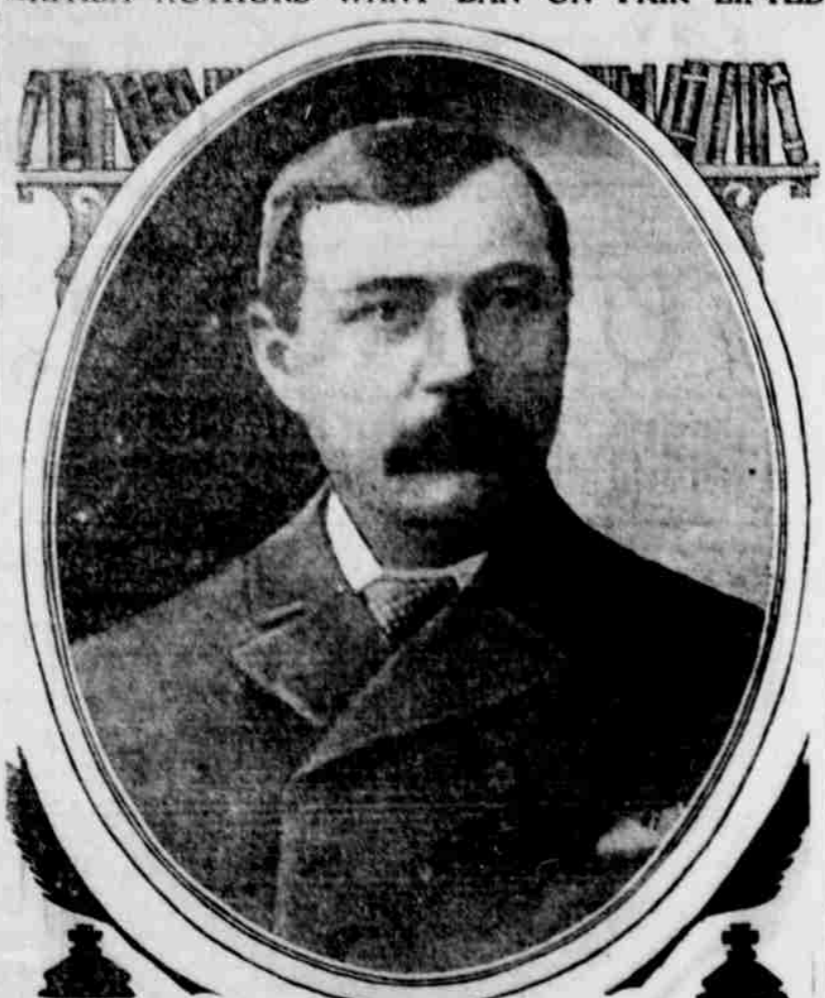
DR. CONAN DOYLE

Sir Arthur Conan Doyle forwarded to Premier Asquith a petition from prominent British authors urging British participation in the Panama-Pacific Exposition in 1915.