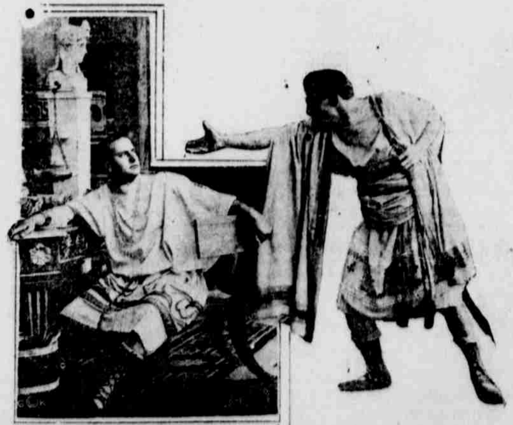
Scene From the Sensational Photo-Drama "Quo Vadis" at Star Theater Sunday, Matinee and Night

Performance lasts two and a quarter hours