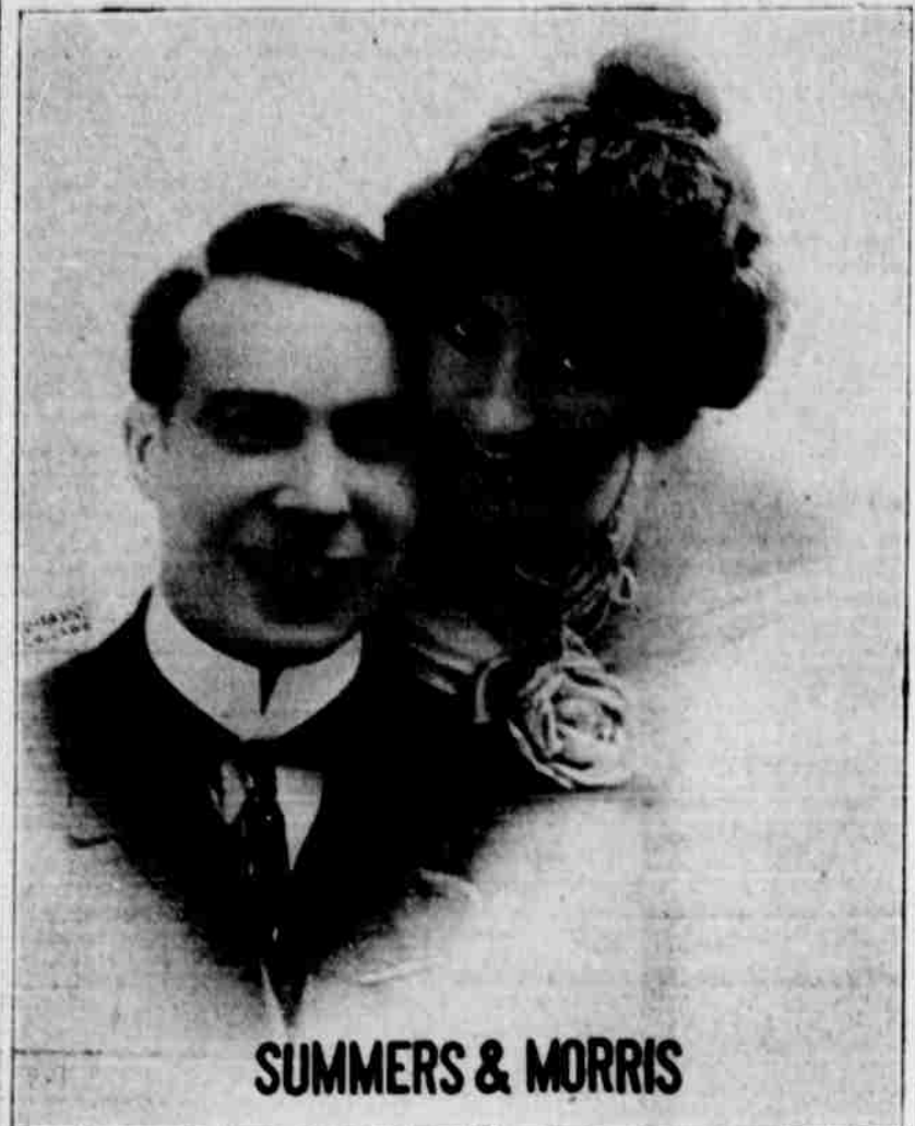
SUMMERS & MORRIS