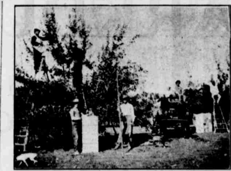
Picking Scene in Bernard Orchard