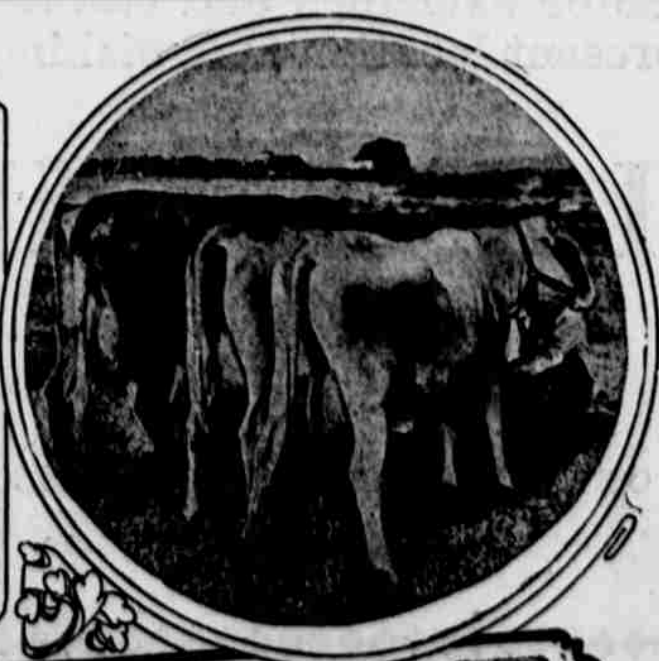
Registered and Thoroughbred Stock Is Seen on many of the Ranches of Southern Oregon