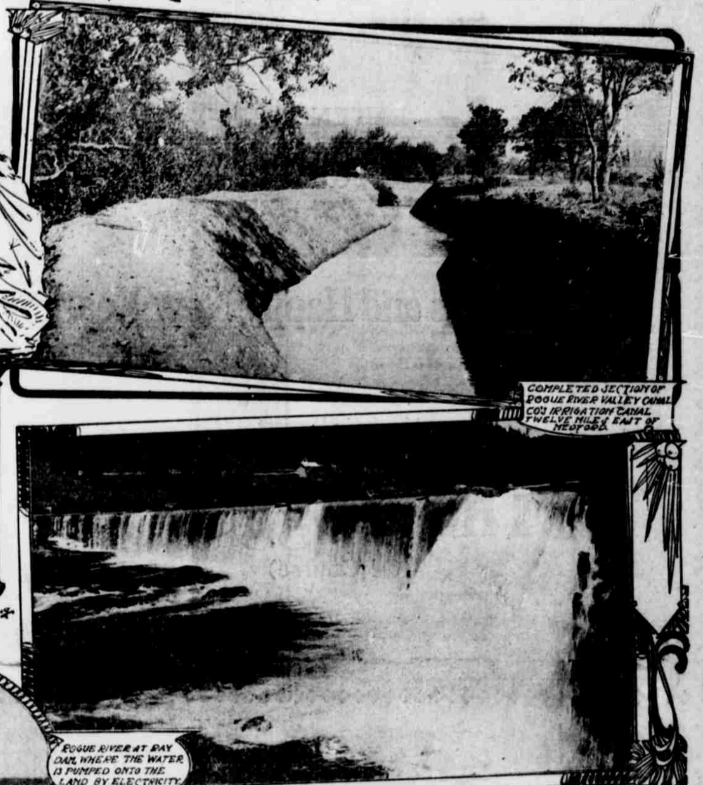
COMPLETED SECTION OF ROGUE RIVER VALLEY CANAL CO'S IRRIGATION CANAL TWELVE MILES EAST OF MEDFORD