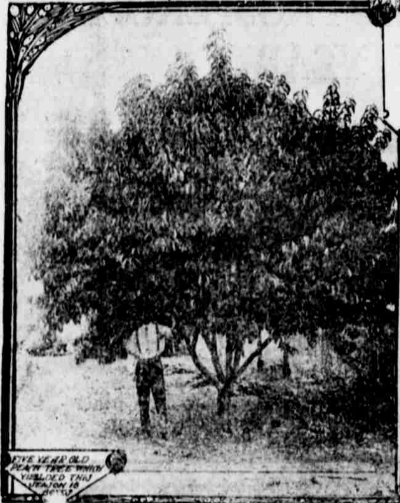
FIVE YEAR OLD PEACH TREE WHICH YIELDED THIS YEAR 100 BUSHELS

Some of the Big Enterprises that will Water Thousands of Acres of Orchards