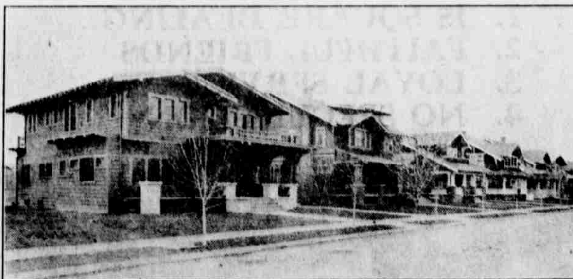
New bungalows on west side of Geneva street, the hardware for which was furnished by the F. W. SHAPLEIGH HARDWARE COMPANY , of Medford, who wish every one a Happy and Prosperous New Year.

WITH GRATEFUL HEARTS FOR Our Prosperity in 1913 WE WISH EVERY ONE A HAPPY NEW YEAR 1914—MANN'S—1914