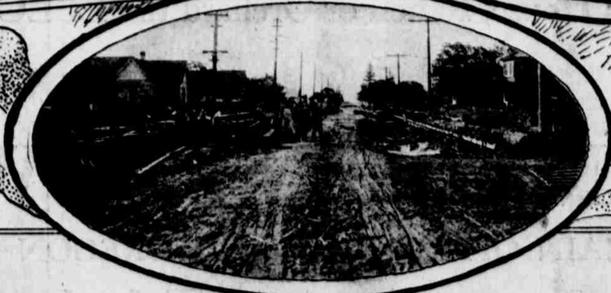
Paving scenes on Medford's Streets, showing Clark-Henery Construction force at work laying sixteen miles of asphalt pavement. The total paving in the city totals twenty miles. Scenes show a temporary stable, mixing plant, laying concrete binder and asphalt, grading teams at work, wagons hauling asphalt and bull dog curbing.

No city in the world excels Medford in the amount of paving for its population. The city boasts of 20 miles of hard surface pavement, practically all of which was laid in the past three years. The cost approximates $1,000,000. The bulk of the pavement is asphalt with concrete base, laid by Clark & Henery Construction company.