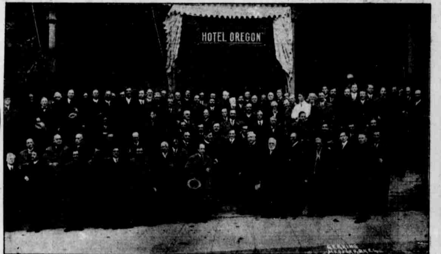
GUESTS BANQUETED BY ASHLAND ON COMMENCEMENT OF HIGHWAY CONSTRUCTION