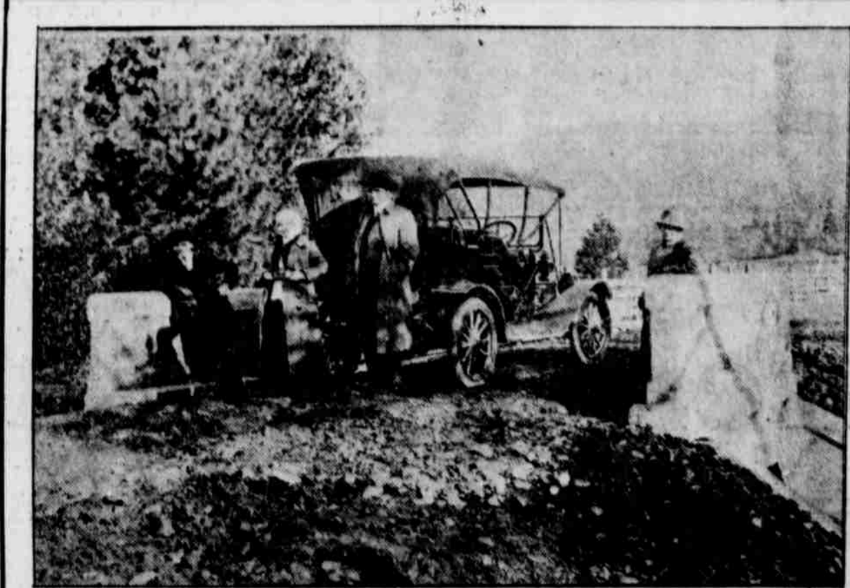
CULVERT ON POSTAL HIGHWAY

structed north through Los Angeles, San Francisco and the Sacramento valley, along the base of Mount Shasta to the Oregon line.