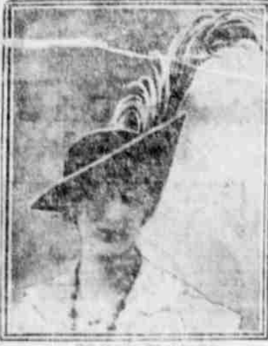
Black punch has trimmed with a paradise plane that accentuates the point of the hat trim.—Mason Art.