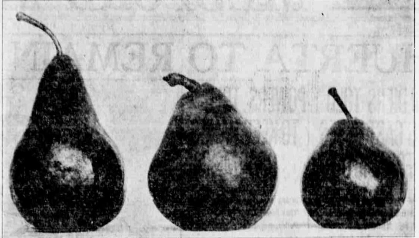
That there is money in pears is shown by the average prices received during the years 1907 to 1912, inclusive: Bartlett $1.35, Howell $1.95, Anjou $2.50, Bosc $2.50, Comice $2.45, Winter Nellis $1.65. Arranged in order of their ripening period: Bartlett, Howell, Anjou, Bosc, Comice, Winter Nellis.