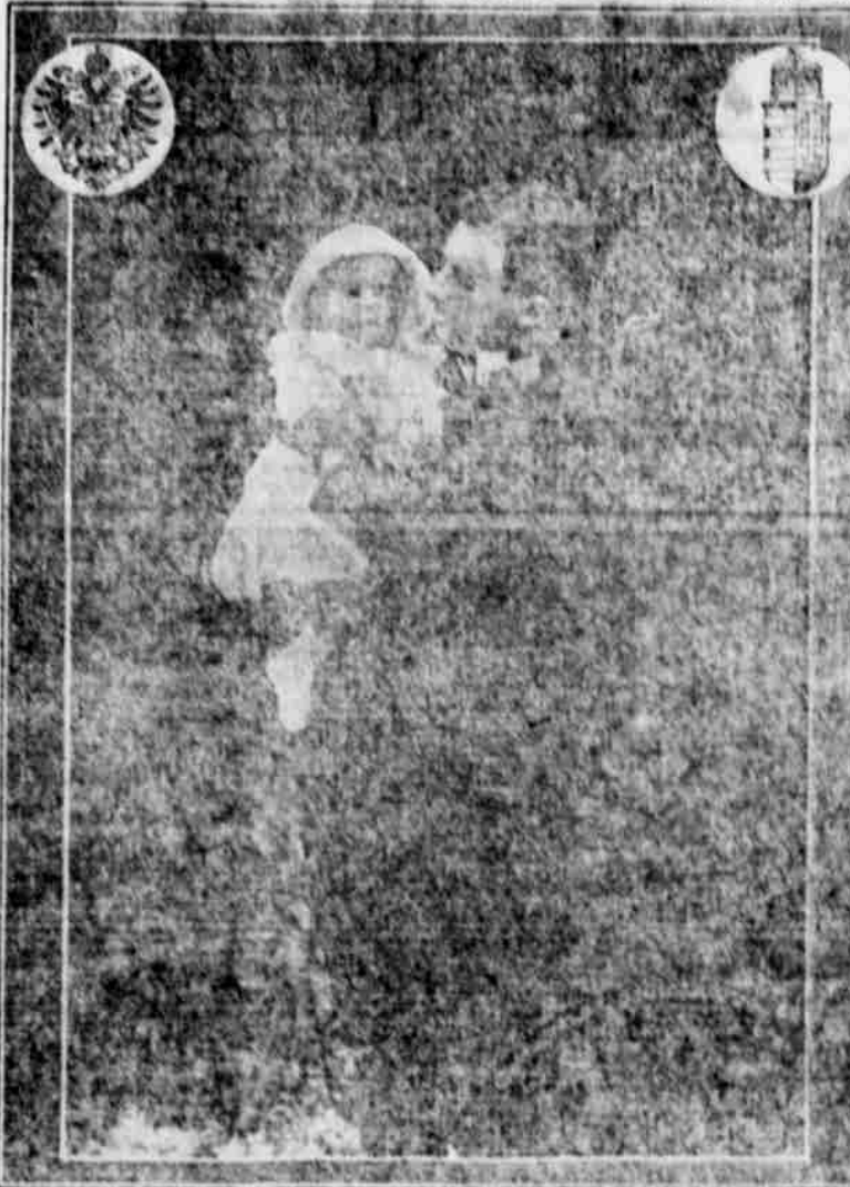
Archduke Charles Francis Joseph, who was born at Pressburg on August 17, 1887, is the grandnephew of Emperor Francis Joseph of Austria. On October 21, 1911, he was married to Zita, Princess de Bourbon de Parme, and their little son, the Archduke Francis Joseph Otto, is said to be the father's heir.