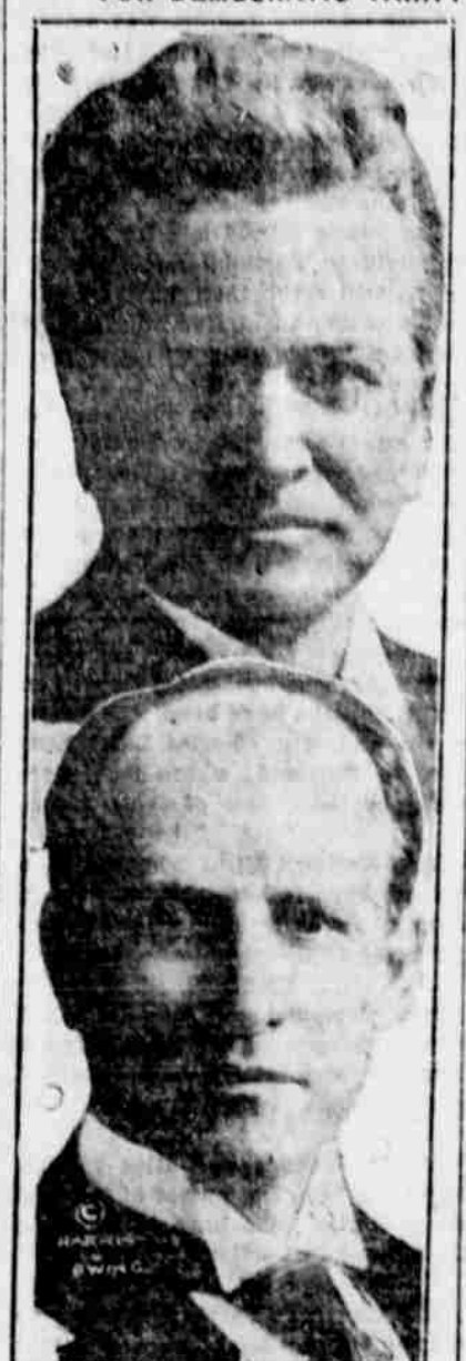
Senator LaFollette Senator Poindexter

Senators Robert M. La Follette and Miles Poindexter, both western- ers, the one of Wisconsin and the other of Washington, voted with the democratic majority in favor of the Underwood tariff bill in the senate. Senator Simmons, chairman of the finance committee, nor any one else in the upper chamber, knew the two would give their support. Conse- quently their action was a great sur- prise. The grounds each took was the general proposition that while they did not like the bill they con- sidered it better than the Payne- Aldrich tariff law.