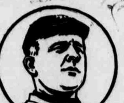
JOHN J. MCGRAW John J. McGraw, manager of the New York Giants, National League Champions, says: "Tuxedo gives in my pipe smoking a keen enjoyment that I have experienced with no other tobacco. Superior in mildness and fragrance is Tuxedo."