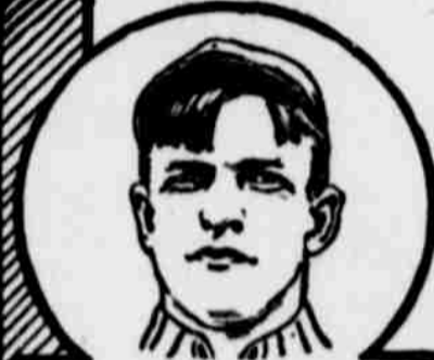
CHRISTY MATHEWSON Christy Mathewson, famous pitcher of the New York Giants, says: "Tuxedo gets to me in a natural, pleasant way. It's what I call good, honest, comfortable tobacco—the kind to stick to."

Look today for Free Offer Sign in a dealer's window or you may be disappointed, as dealers have only a limited supply of these Pin Cushions and cannot obtain more. Get 10 cents' worth of TUXEDO and ask the dealer for the "Tea Pot" Pin Cushion FREE.