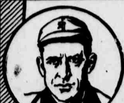
FRED CLARKE Fred Clarke, famous manager of the Pittsburgh Pirates, says: "I'd advise every ball player to smoke Tuxedo. I do, always. I know of no other tobacco that gives the satisfaction that Tuxedo does."