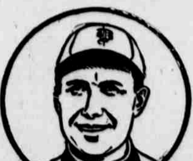
"HUGHIE" JENNINGS Hughie Jennings, manager of the Detroit "Tigers," says: "After a red-hot finish in a ball game, a pinch of Tuxedo makes victory sweeter or defeat more endurable. Watch for Tuxedo."