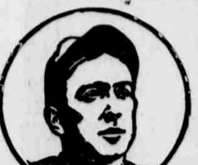
JOE TINKER Joe Tinker, manager and short stop of the Cincinnati National League team, says: "A pinch of Tuxedo after the game is the most restful smoke I can find."