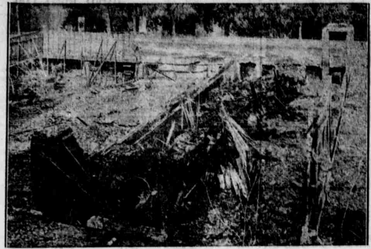
This photograph, taken after the fire which destroyed the Binghamton, N. Y., Clothing Factory, where some sixty-three girls lost their lives, shows the smouldering ruins where the bodies of thirty-five victims are believed to be buried. Firemen and others have worked night and day digging in the brick and mortar to haul out the bodies.