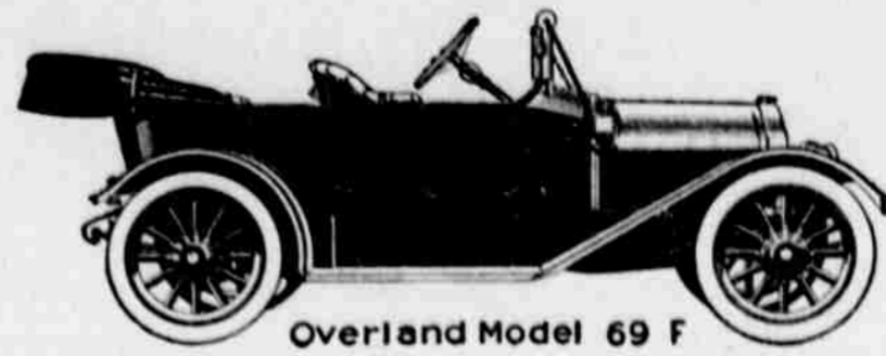
Overland Model 69 F

The Art of Singing Available for Concert and Church Residence Studio 1207 West Main St. Phone 483