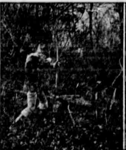
THE BOW AND ARROW.