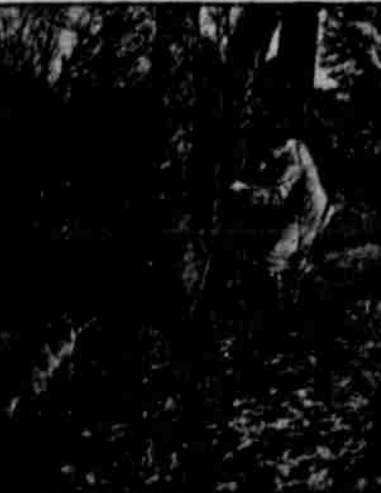
THE MODERN AUTOLOADING RIFLE.

The Dramatic Story of the Onward March That Has Raised Man From the Skulking, Hiding Creature of the Dawn of History to the Mastery of His Earthly Domain.