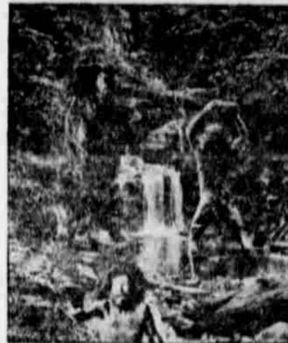
THE FIRST MISSILE.

THE SIX STAGES IN MAN'S DEVELOPMENT OF HIS MEANS OF DEFENSE AND OFFENSE