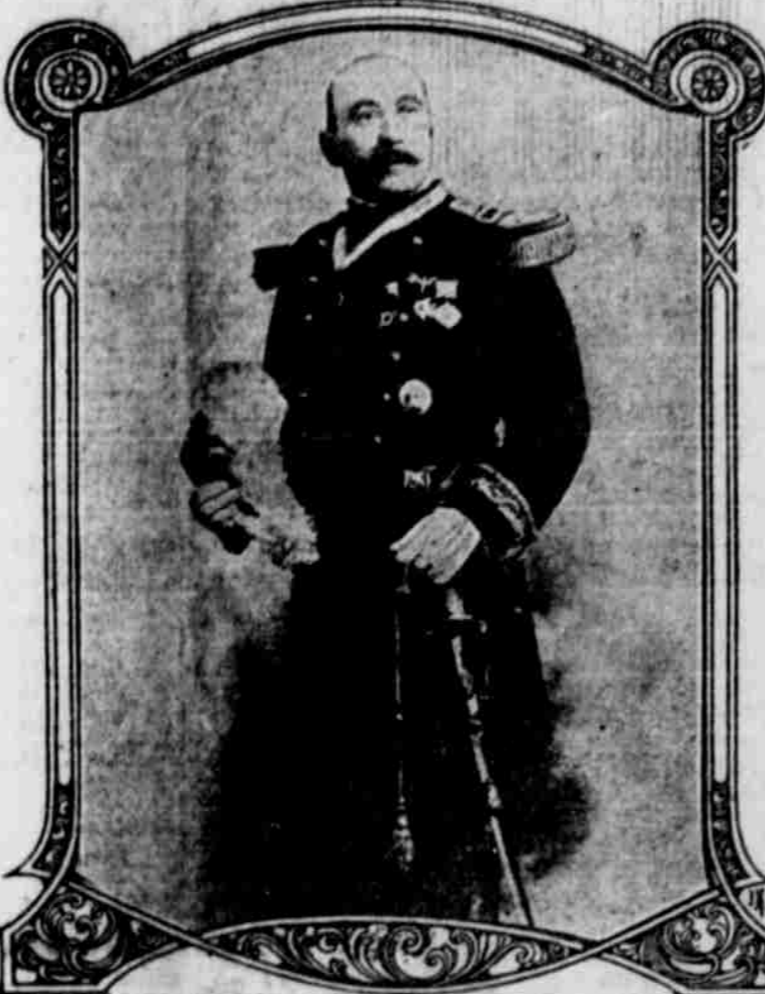
GENERAL VICTORIANO HUERTA