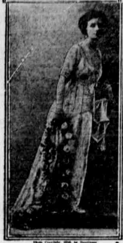
White silk voile evening gown, embroidered with silver. Hip sash placed between skirt and overdress.