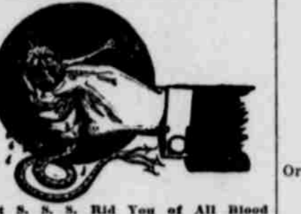
Let S. S. S. Rid You of All Blood Disorders.

Wonderful How Quickly Your Entire System Awakens When the Blood is Cleaned.