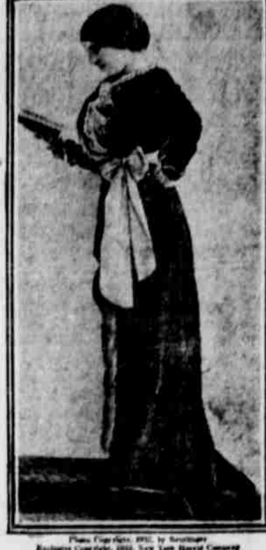
pretty touch to this black velvet gown is the yellow such with its well place loops and ends.—Malson Buzenet.