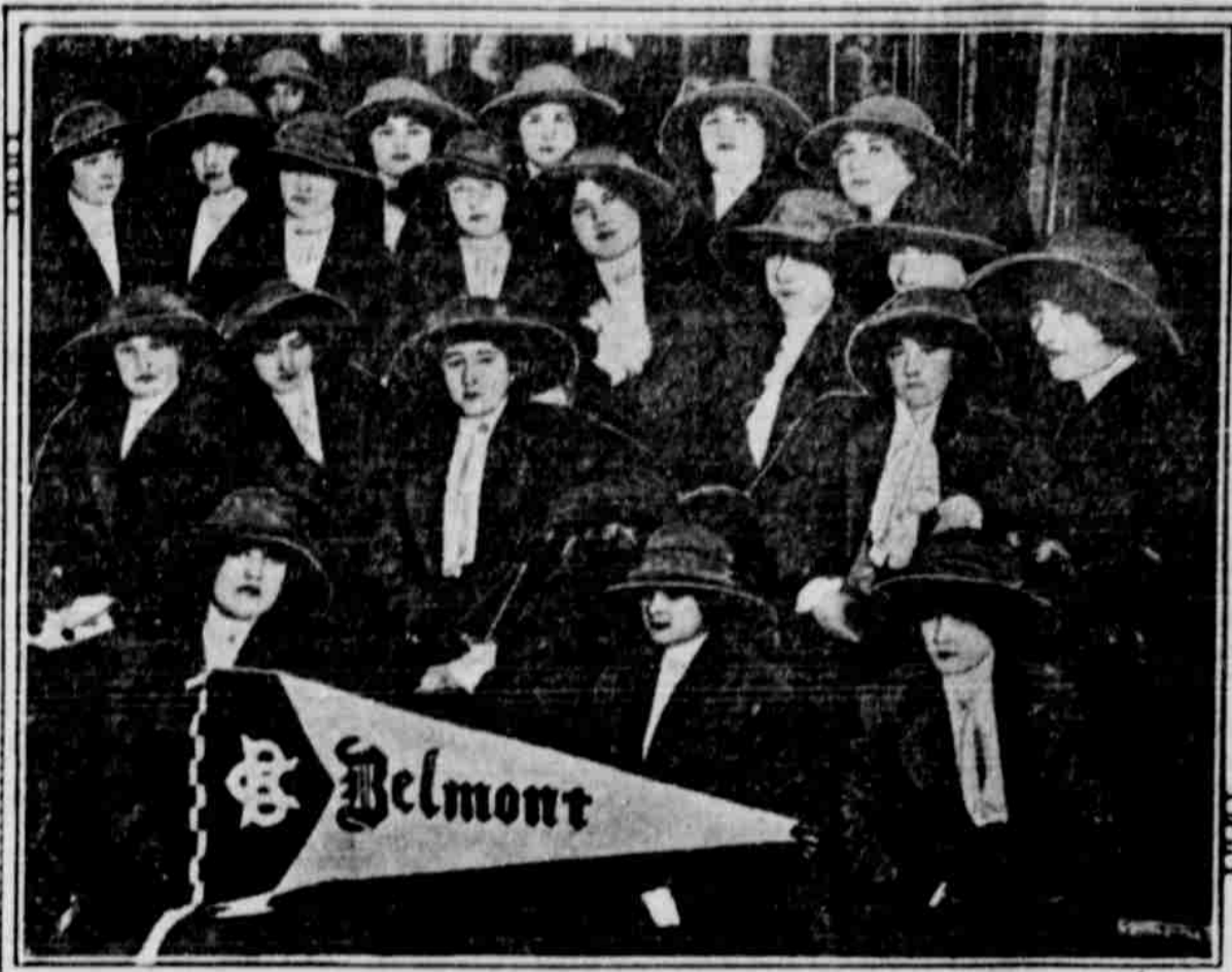
BELMONT COLLEGE GIRLS IN THE CUMBERLAND HOTEL