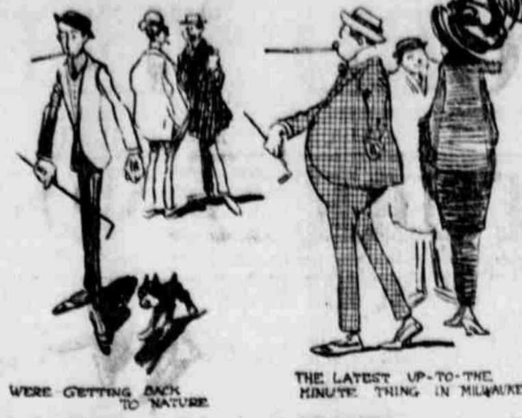
WERE GETTING BACK TO NATURE