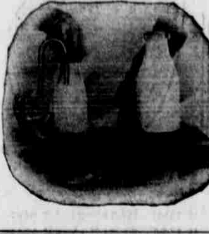
Star Cream Siphon