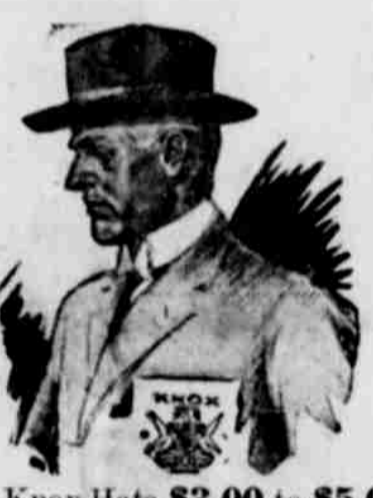
Knox Hats $3.00 to $5.00