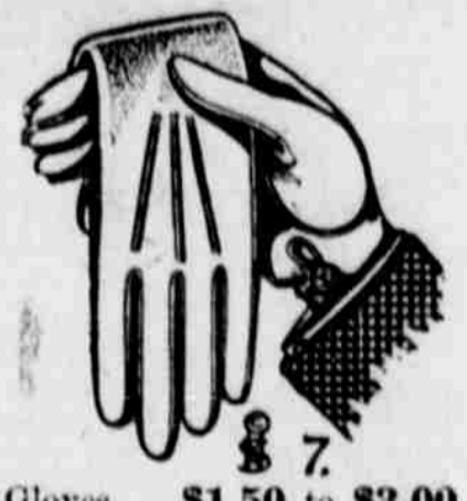
Gloves.....$1.50 to $3.00

If it's for a man or boy you will find what He would like here