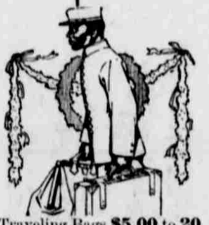
Traveling Bags $5.00 to 20