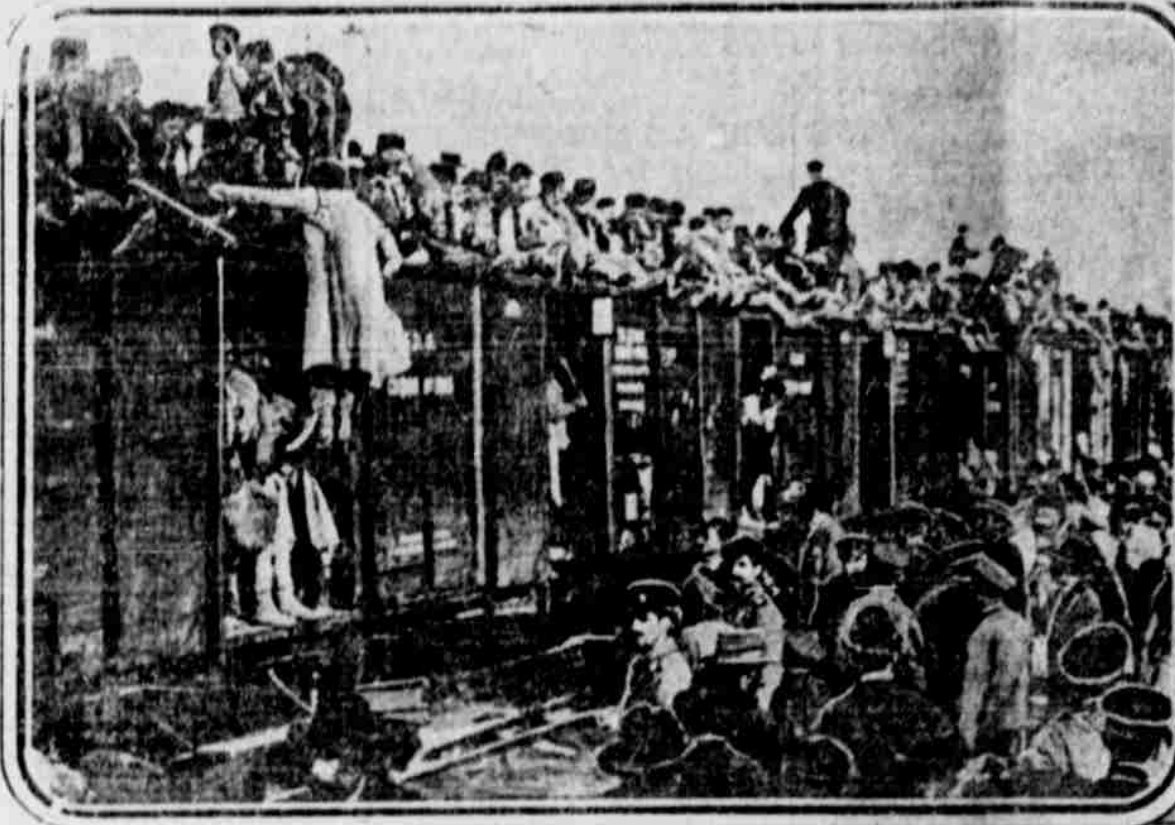
SERBIAN RESERVISTS LEAVING JORDA TO REINFORCE THE BULGARIANS IN FRONT OF ADRIANOPLE